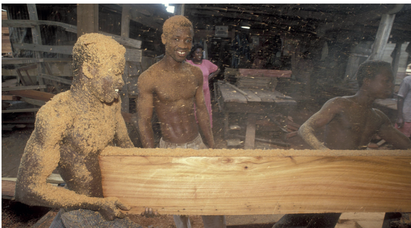
Lumber yard factory, Ghana.

Counter-intuitively, the impact of economic growth on employment seems to have been negative. Those countries that experienced the least growth were more apt at generating well-paying jobs than their faster growing neighbours. This suggests that growth has come from industries that are not employment intensive and workers are thus pushed towards the informal sectors.