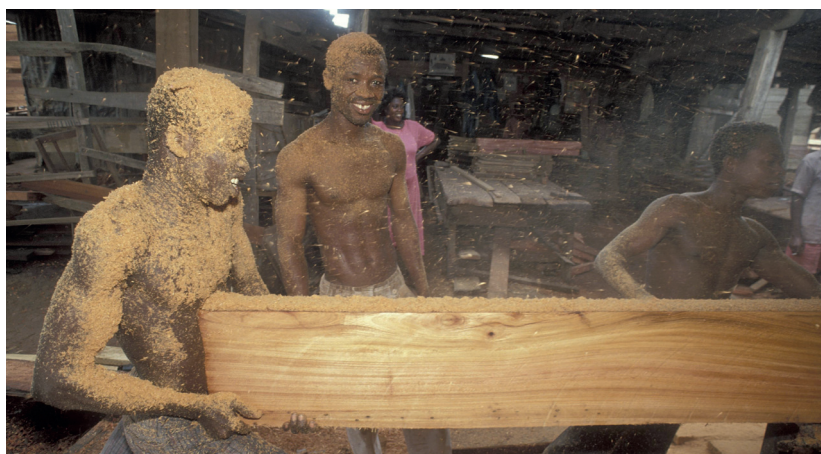
Lumber yard factory, Ghana.

Counter-intuitively, the impact of economic growth on employment seems to have been negative. Those countries that experienced the least growth were more apt at generating well-paying jobs than their faster growing neighbours. This suggests that growth has come from industries that are not employment intensive and workers are thus pushed towards the informal sectors.